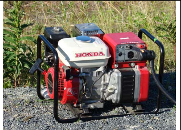
Figures 1, 2 and 3 above – Emergency Power (solar battery rechargers and generator) [100% Emergency Power]