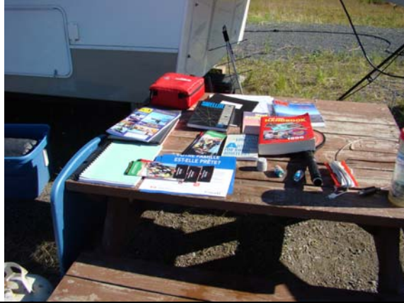
Figure 5 – Information Table [Information Booth]

Figures 1 and 2 above – [6 Natural Power QSOs]