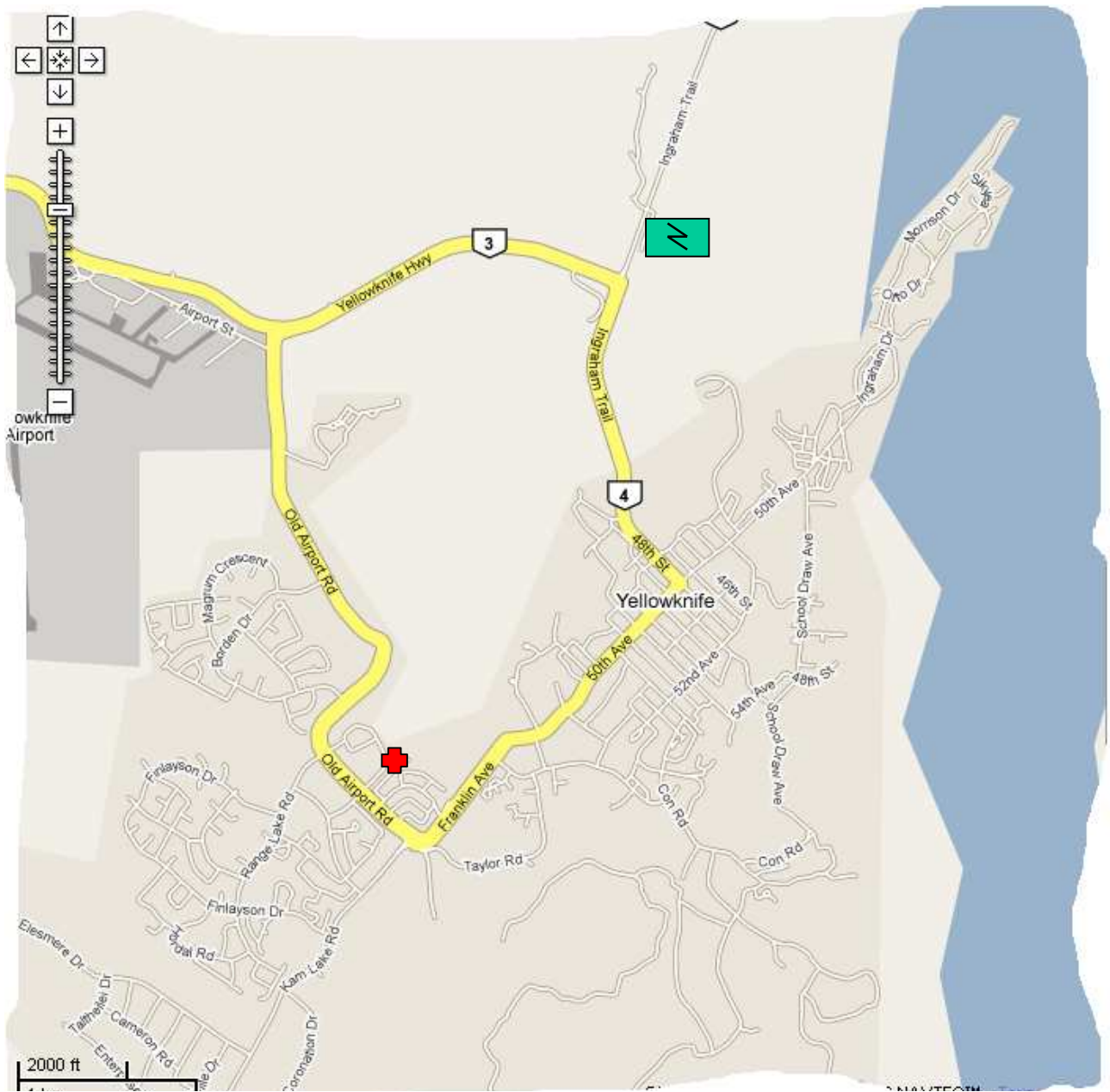
Figure 1 - Field Day Site