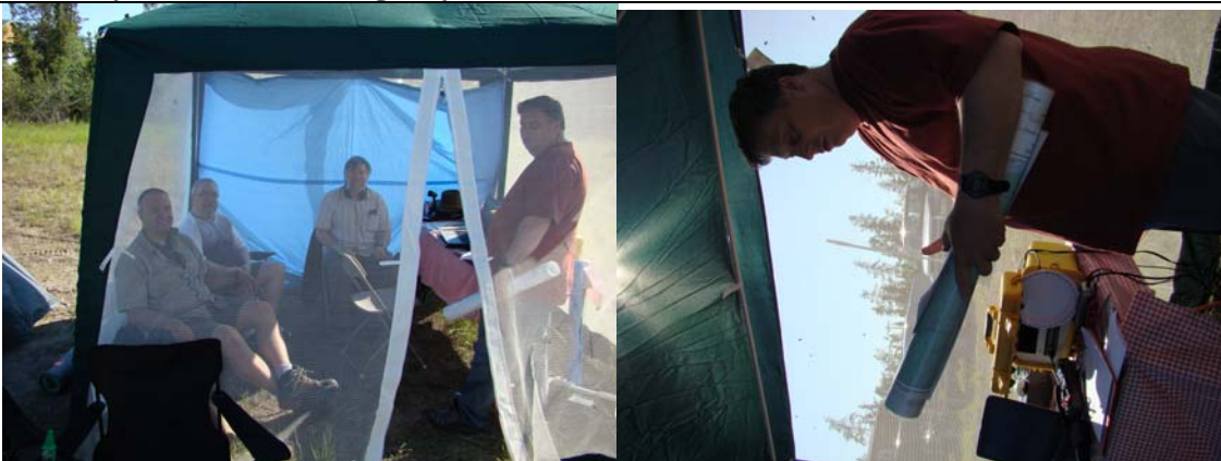
Figure 7 – Lecture on Map Reading and GPS by Yellowknife Search and Rescue [Educational Activity Bonus]