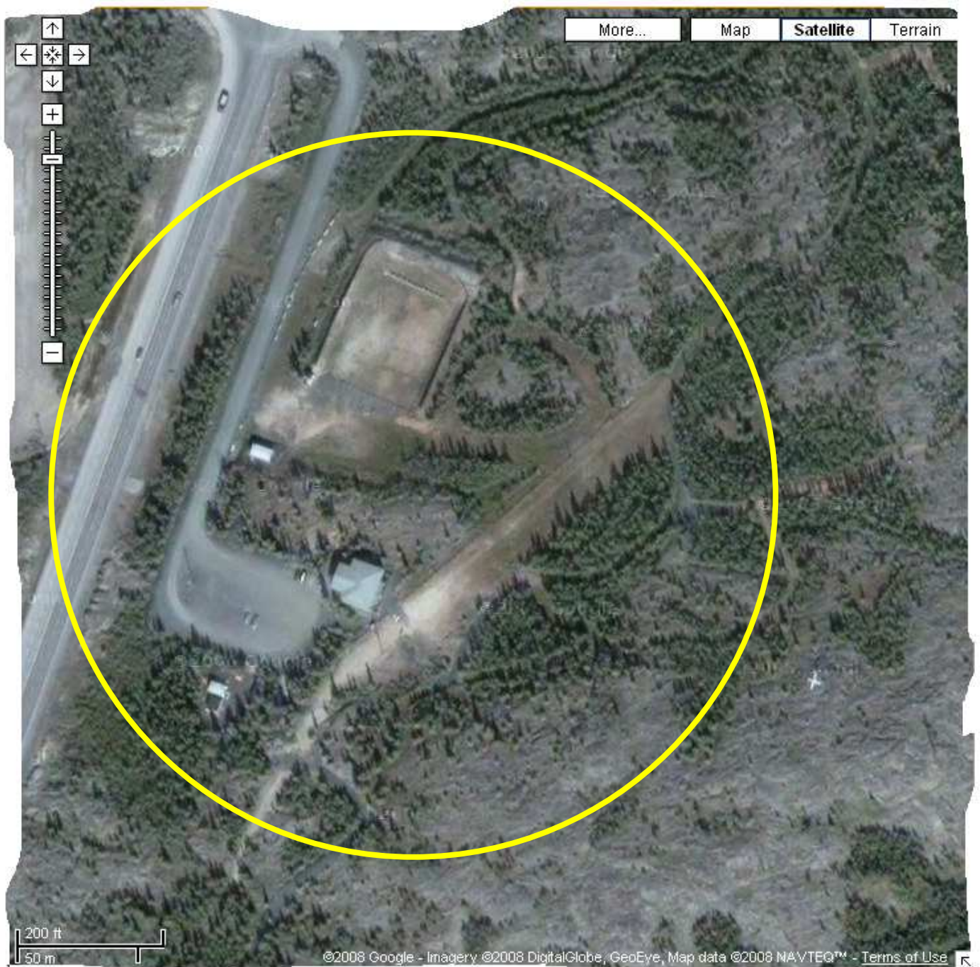
Figure 2 - Field Day Site

Figures 1 and 2 delimit the Field Day work site generally. The work site is approximately 3 km from downtown Yellowknife and is located at the Yellowknife Ski Club, directly opposite the Yellowknife dump.