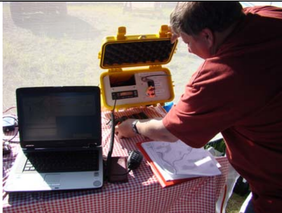
Figure 6 – Concurrent testing and radio exercise using a Yellowknife Search and Rescue Radio assembled by club members (person in foreground is the training officer for Yellowknife Search and Rescue) [Site visit by invited served agency official]

Figures 1 and 2 above – [6 Natural Power QSOs]